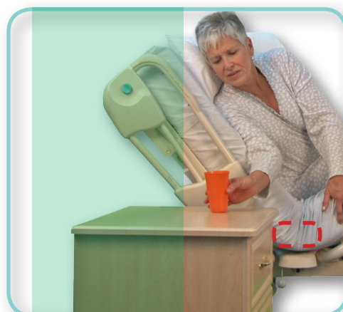
Ordinary fixed deck bed: the seat deck does not move during HOB elevation, forcing user out of vertical alignment.