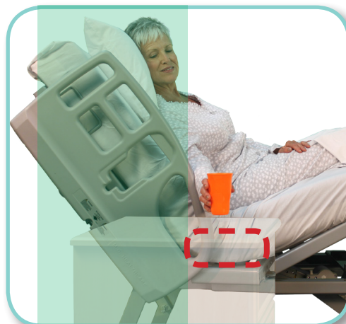
Encore: seat deck retracts during HOB elevation maintaining the user in a safer comfortable zone of vertical alignment (shaded green).